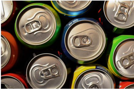
Aluminum & Steel Cans