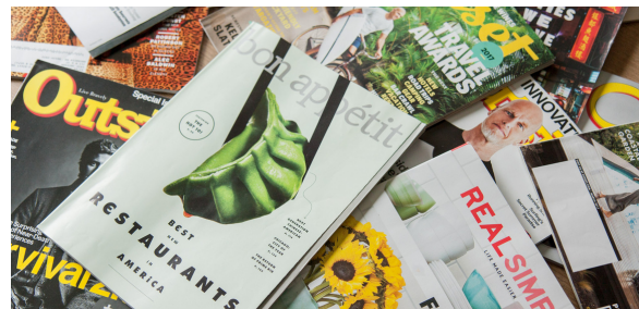
Magazines and glossy paper