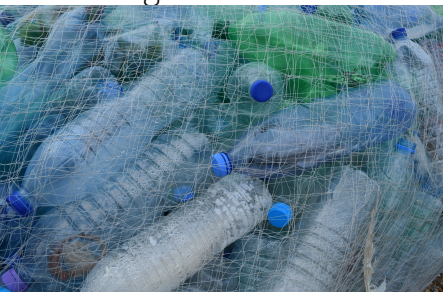
#1 Plastic water & Soda Bottles;