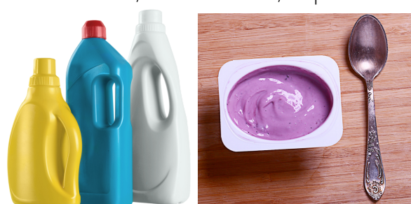
ANY OTHER PLASTIC.

Mudlick Recycling Center Hours: M-F 7:30 AM - 3:15 PM; SAT 7:30 AM - 11:45 AM