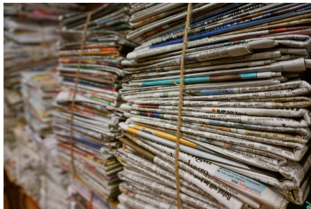
Newspapers & Office Paper