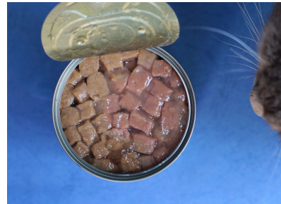
Aerosols, pet food, any can with a liner